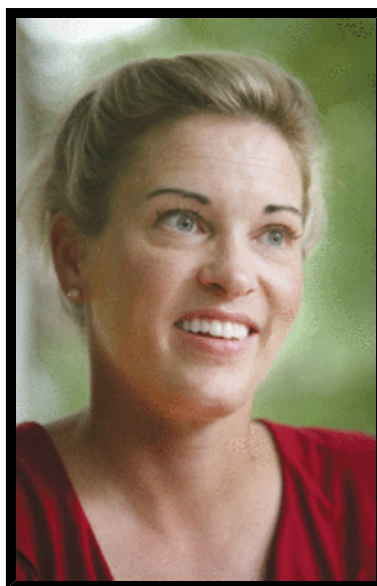
Suzy Favor Hamilton

Casey FitzRandolph is a three-time Olympic competitor in speed skating, who won the Gold Medal at Salt Lake City in 2002, and holds the Olympic record for fastest 500m in long-track speed skating. He graduated from Verona Area High